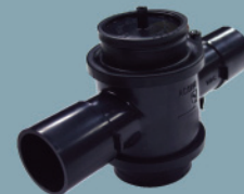
EXTRACTION VALVE 3