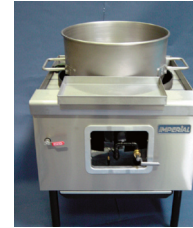
4705770 & 4705792