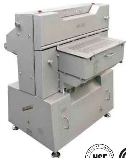
6755405 - Front view